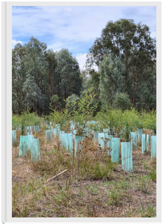
Revegetation patch after 2 years

Because of high Kangaroo numbers at the sites, we used tree guards to try and improve the success rate