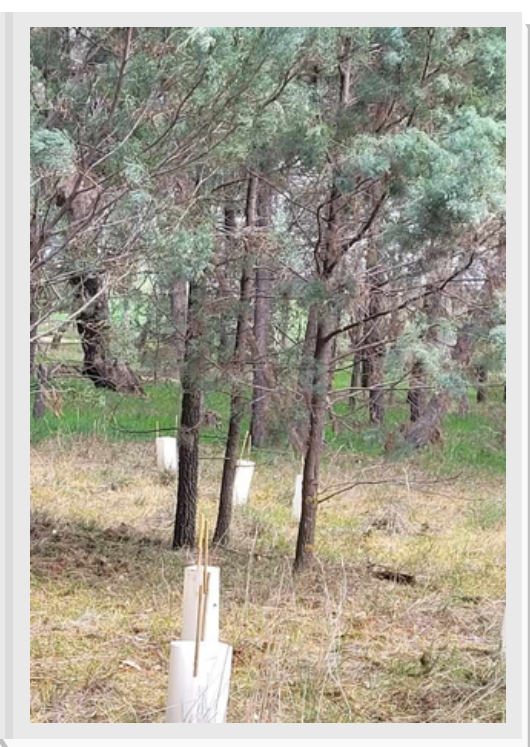
Tubestock planting in a White Cypress Pine Woodland

The Redlands Hill Reserve is 61ha protected Grassy Woodland public reserve. 1 ha of White Cypress Pine woodland was marked out for the demonstration. The density of trees was on average 21,400 stems per ha. The target for this area is 250 to 300 stems per ha. In the thinned area there is noticeable regeneration of Wedged-leaf Hop Bush, Varnish Wattle and Golden Wattle. It is hoped that the remaining White Cypress Pine will increase their size. Some understorey tubestock was also planted in the reserve.