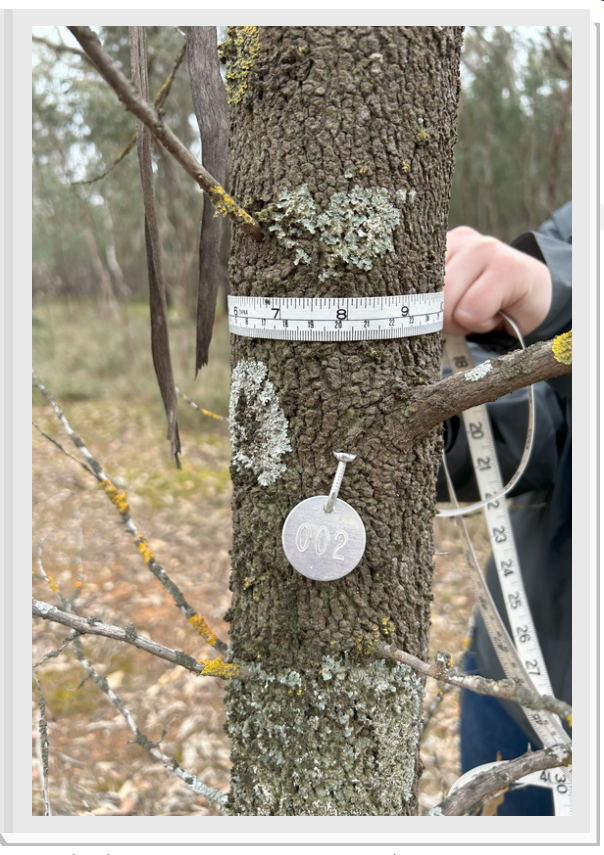
Tagged White Cypress Pine tree at demonstration site