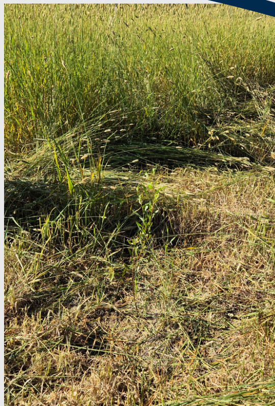
Photo of what we would expect it to look like - a success in 30 years